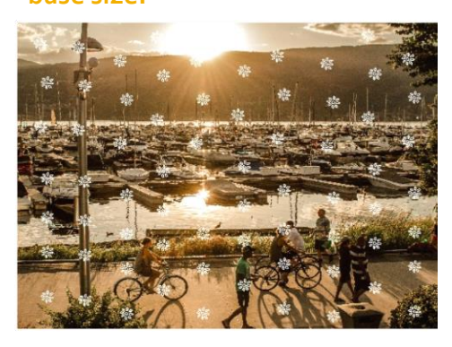
The City's current population density is 601/km<sup>2</sup>.