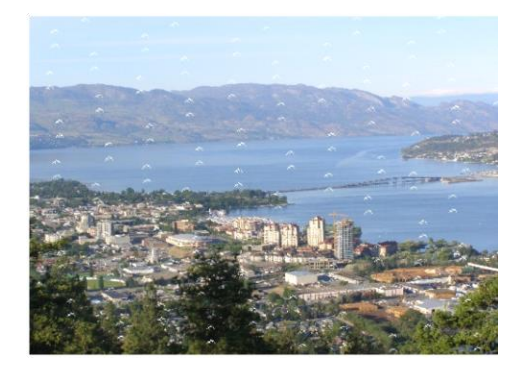
Kelowna is 211 km<sup>2</sup> in its land base size.