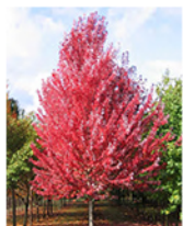
Acer rubrum 'Franks Red' - Form