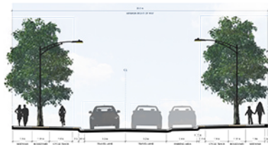
Typical Cross Section of Ethel Street - Scale 1:100