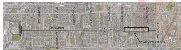
Ethel Street Active Transportation Corridor - Project Limits