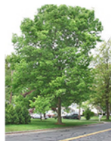
Celtis occidentalis - Form