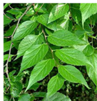
Celtis occidentalis - Leaves