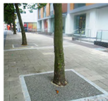
Mulch Tree Pits With Concrete Curb