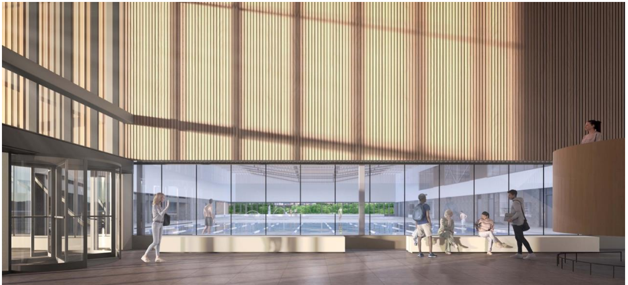
Architectural Renderings Redevelopment of Parkinson Recreation Centre, West Lobby (top), East Lobby view south (bottom) Diamond Schmitt Architects, Stantec