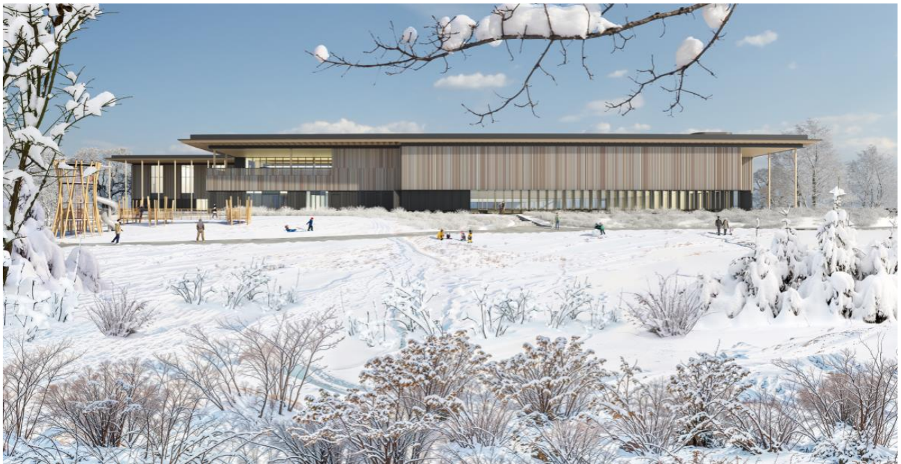
Architectural rendering redevelopment of Parkinson Recreation Centre, Diamond Schmitt Architects, Stantec

Online Information Session via Microsoft Teams: Wednesday, August 13, 2025 at 6:00 PM (PDT) Join the meeting now