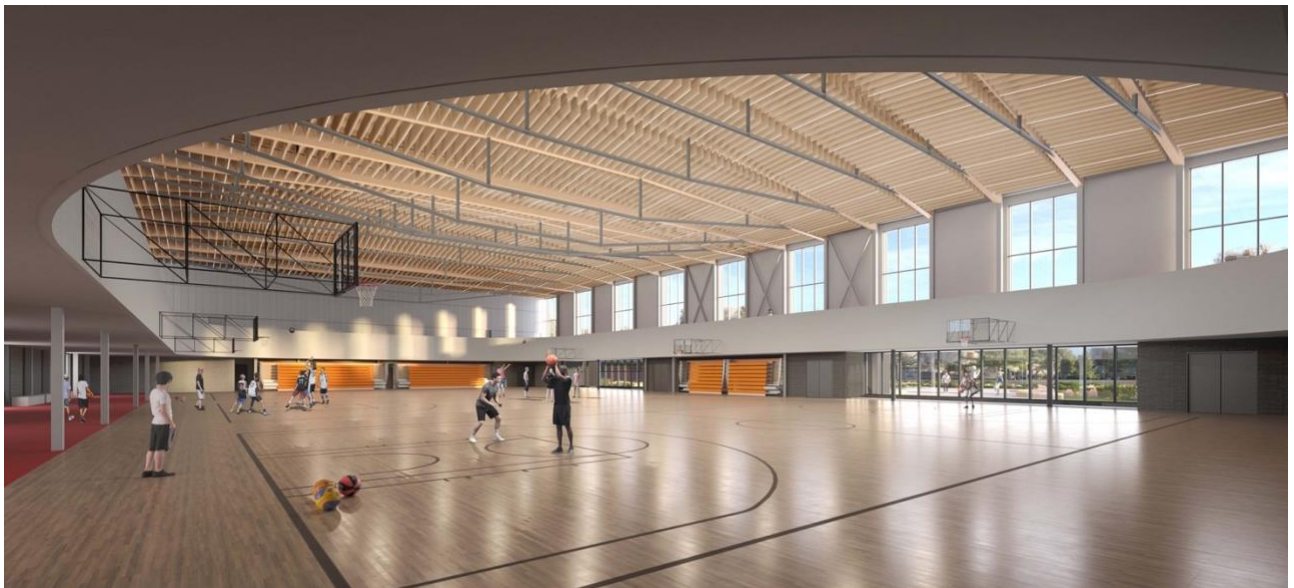
Architectural Rendering Redevelopment of Parkinson Recreation Centre, Level 2 Gymnasium and Running Track Diamond Schmitt Architects, Stantec