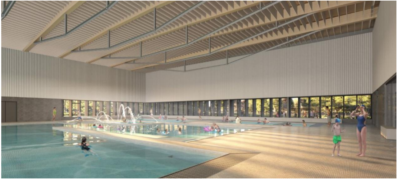
Architectural Rendering Redevelopment of Parkinson Recreation Centre, Level 1 Lane & Leisure Area Diamond Schmitt Architects, Stantec