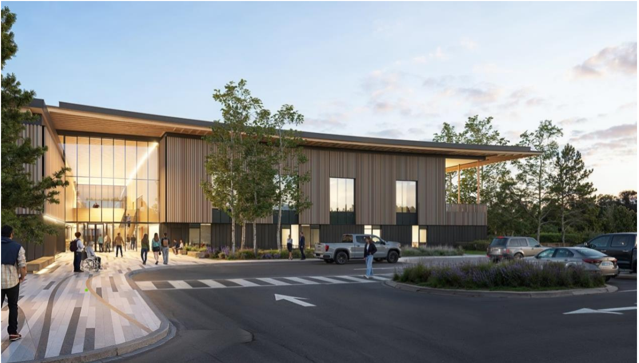
Architectural Renderings Redevelopment of Parkinson Recreation Centre, West Porch Plaza (top), East Plaza (bottom) Diamond Schmitt Architects, Stantec