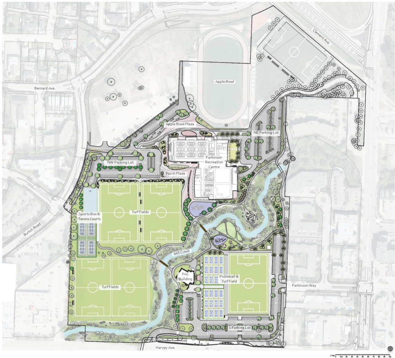
BSK General Site Plan, Redevelopment of Parkinson Recreation Centre Van der Zalm + Associates, Scatliff + Miller + Murray

Other areas/locations on the PRC site may arise as the project develops and in response to artists’ practices.