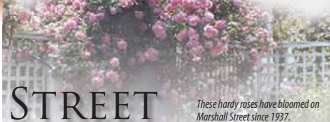
These hardy roses have bloomed on Marshall Street since 1937.