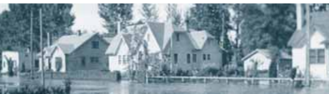
Spring flooding on Marshall Street c. 1940s. Flooding was an annual event as Mill Creek overflowed its banks each spring, and groceries were sometimes delivered in a canoe. In the 1990s the city installed a diversion system which reduced the flood risk for residents.