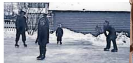
Homemade fun on Marshall Street.