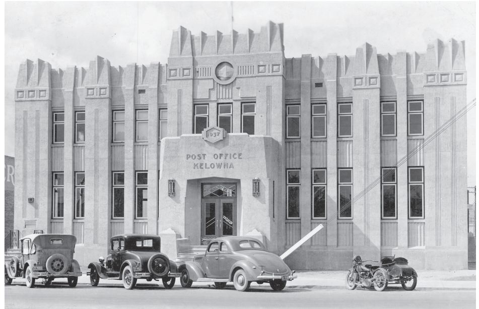
Kelowna Post Office

Explore protective mechanisms for other potential heritage neighbourhoods.