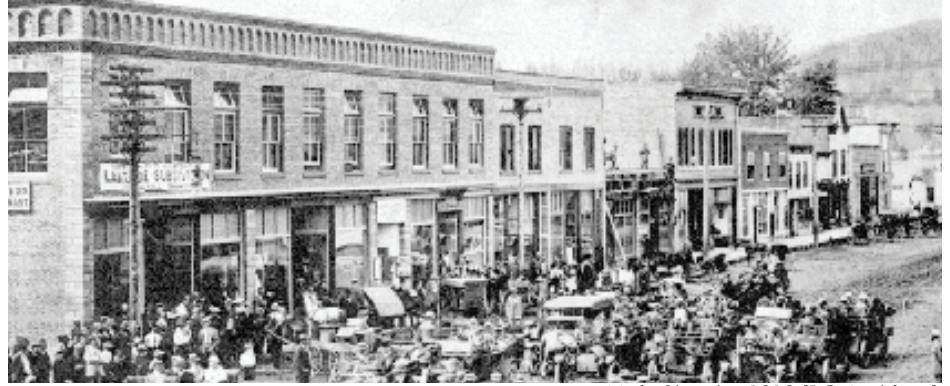
Main Street c.1912.

Continue to preserve and protect significant heritage resources through the use of protection tools and heritage planning initiatives.