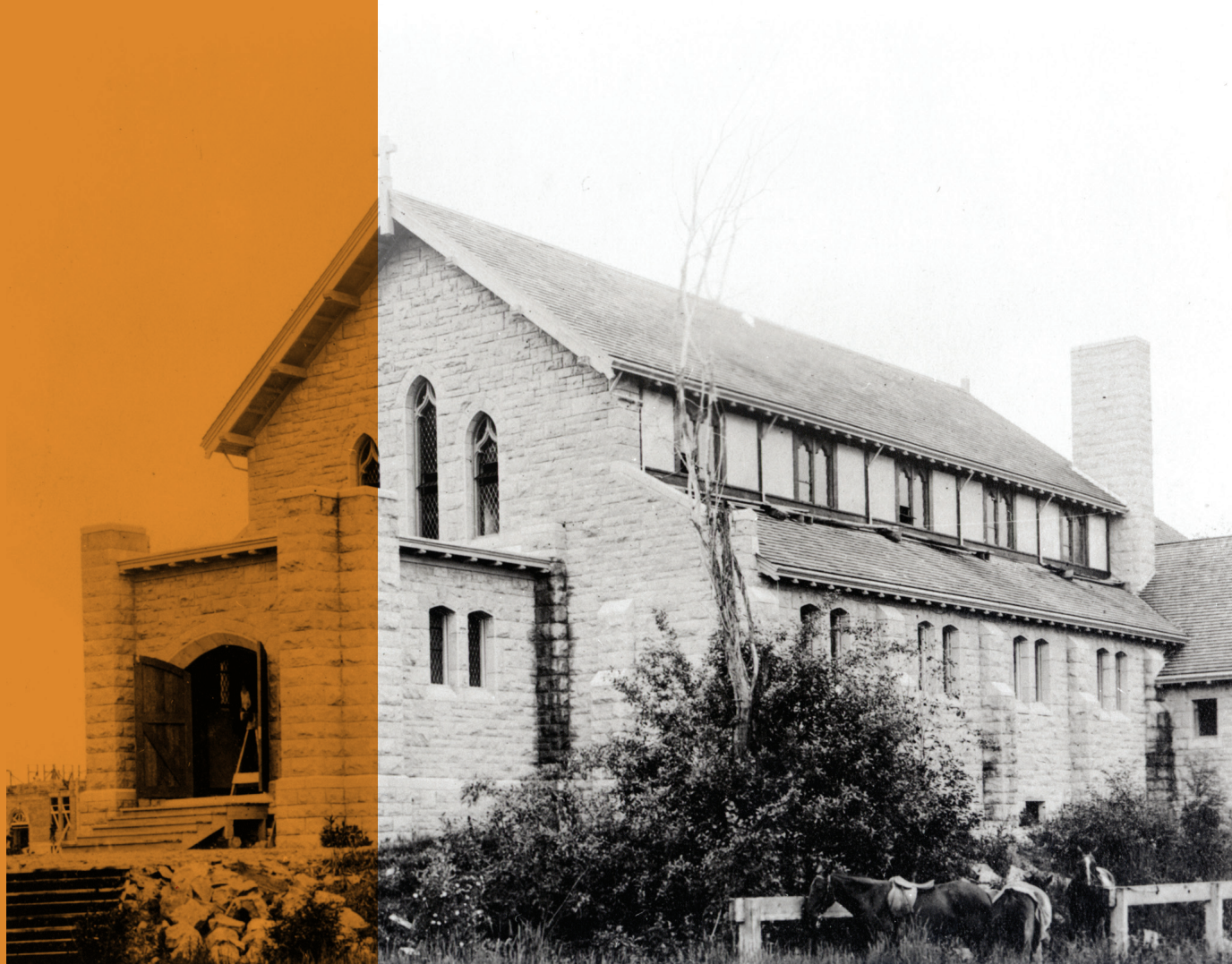
St. Michael's Church

The Heritage Strategy recommends the following eight high-level strategies that fulfill the Mission Statement and realize the Vision. They have been developed based on background research and stakeholder, resident and City consultation.