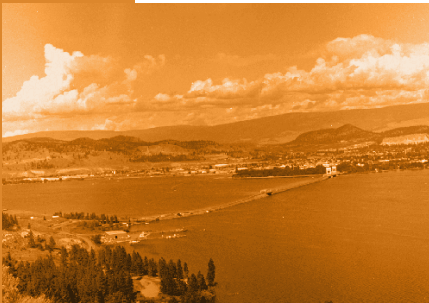
Kelowna's Floating Bridge, 1976