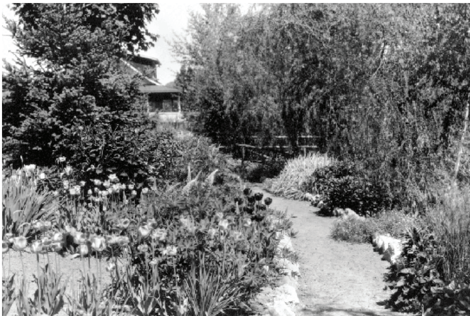
Kelwona Garden, c.1920s

4. DO you have any comments or suggestions about today's open house?