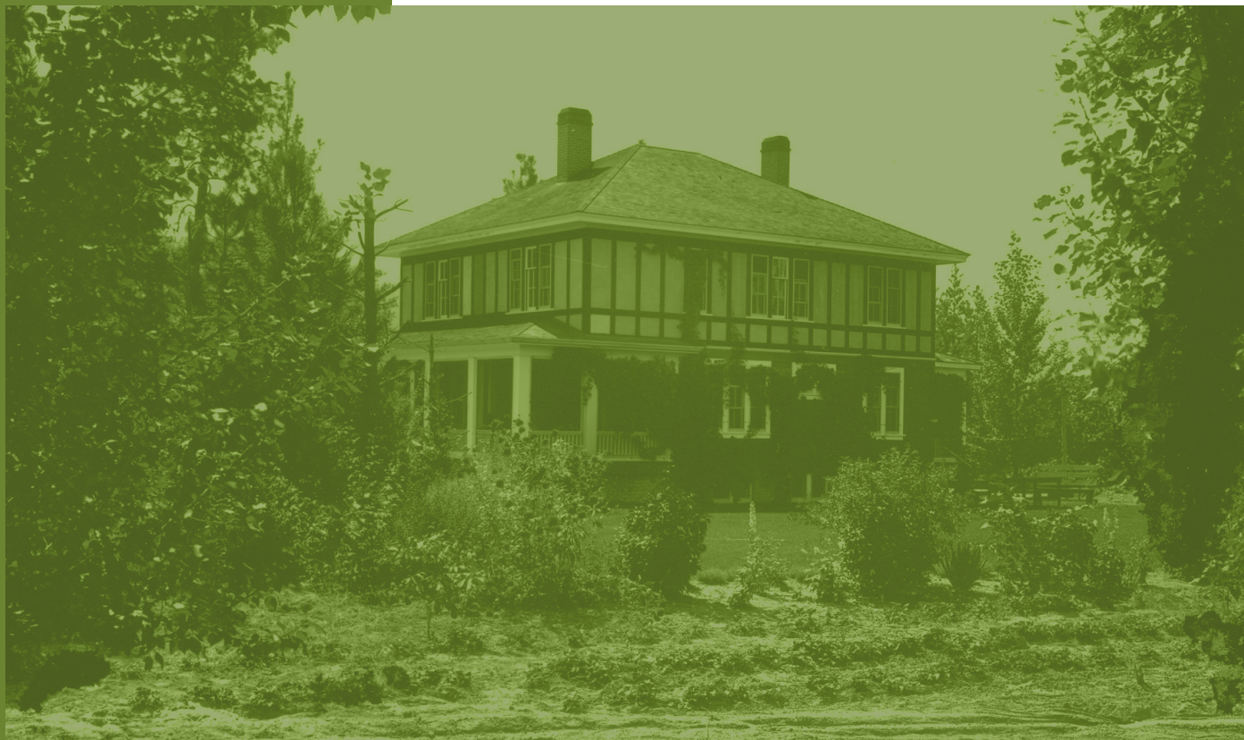
Belgo House, 1590-1640 Belgo Road