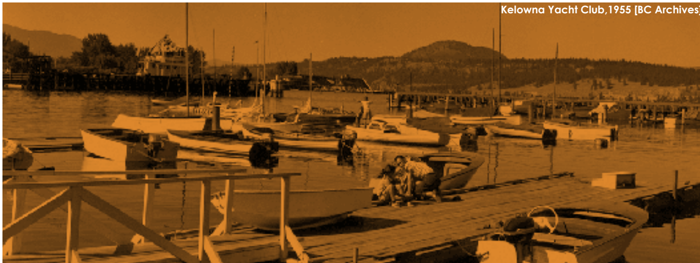
Kelowna Yacht Club, 1955