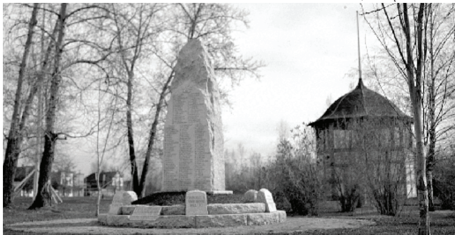
Kelowna Great War Memorial, 1926

Enhance partnerships between the City and all aspects of community heritage, to achieve an inclusive, community-based approach to heritage.