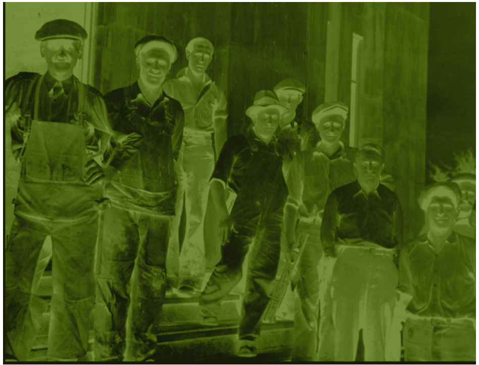
Kelowna Construction Crew