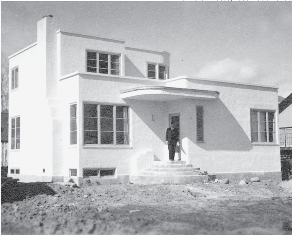
Penticton House, 1858 Abbott Street