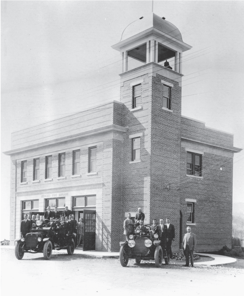
Kelowna Fire Hall

Develop a program of ongoing monitoring and renewal of the heritage program.