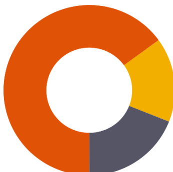
Maintain (65%) Growth (16%) New (19%)