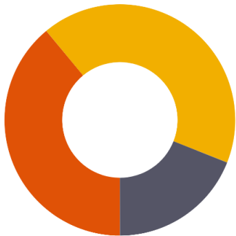
Renew (39%) Growth (42%) New (19%)