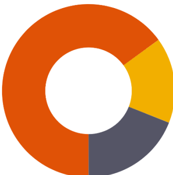
Maintain (65%) Growth (16%) New (19%)