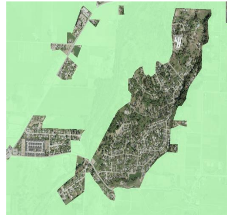
Pockets of residential subdivisions surrounded by farm land (green)

Farming is an industry, and normal farm practices such as the use of sprays and machinery can have impacts such as spray drift and dust that migrates to urban neighbours, creating conflicts. Conflicts can make it hard for farmers to farm, either from complaints, or trespass, littering or vandalism. Similarly, farming practices can make it challenging for residents to enjoy their homes and outdoor spaces. Buffers, including fencing and plantings, can mitigate some of these conflicts.