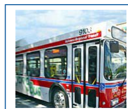
Improved Transit Services

Provisions for future corridor of the COMC from McCurdy to UBC-O will be addressed by broader consultation in the planning, engaging the community as a whole, prior to inclusion in the next OCP review and revisions to the 20 Year Servicing Plan and Financing Strategy.