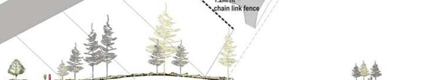
SCHEMATIC SECTION NIS