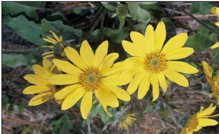
Official Flower - Sunflower

*Parks stats include only municipal parkland - regional and provincial parks within the City boundary have been removed.